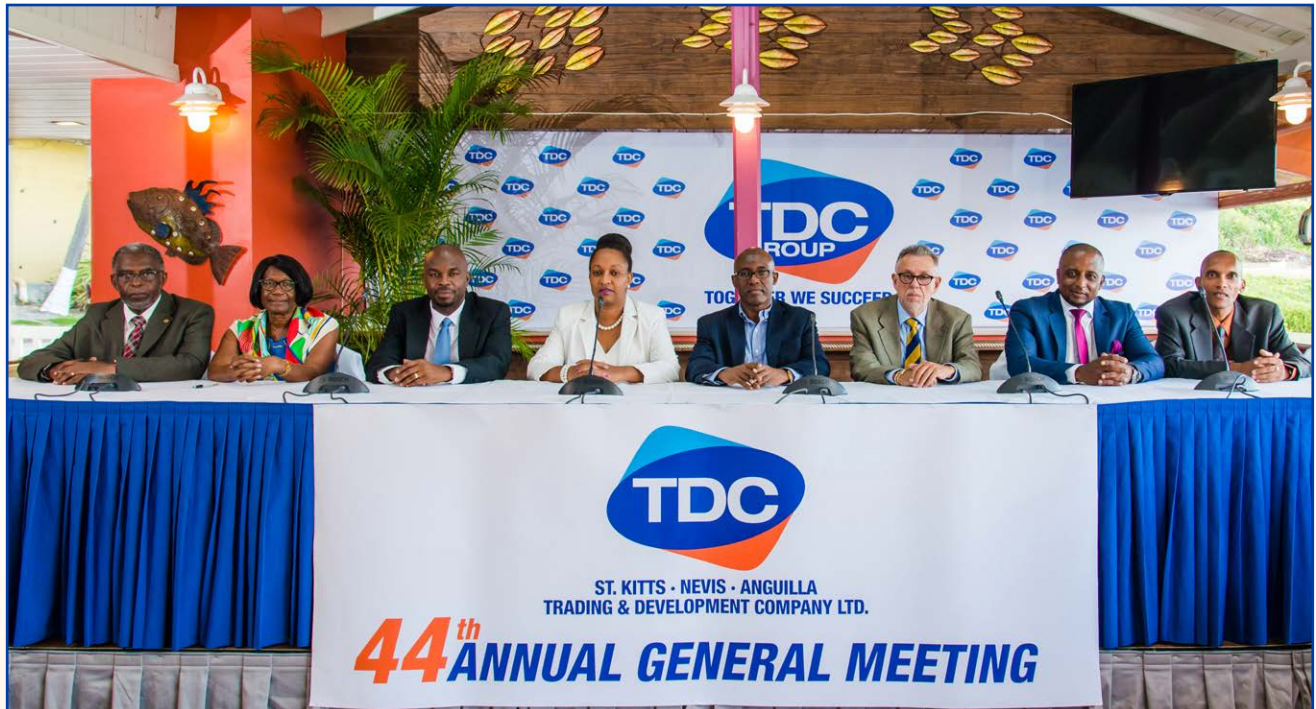
(Photograph taken of the Board of Directors at the 2017 Annual General Meeting)